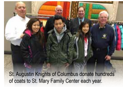
St. Augustin Knights of Columbus donate hundreds of coats to St. Mary Family Center each year.