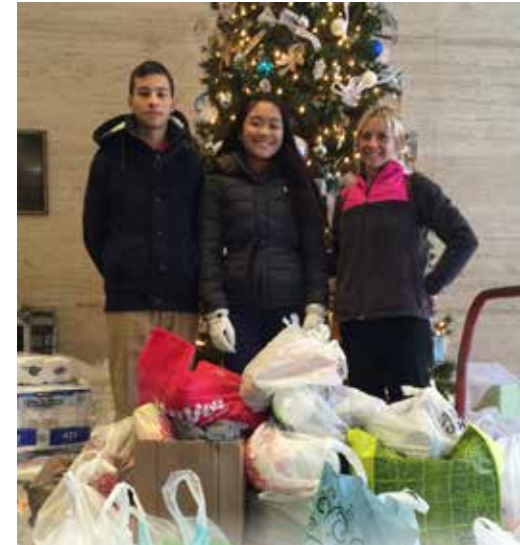
Students from Holy Family School collected personal care items for Poverty Reduction Programs.